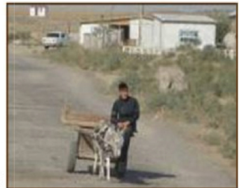
Rural village life in Kazakhstan

We are seeking new interns and civil participants to engage in these projects, and invite proposals for new community service projects, research, and ventures for publications.